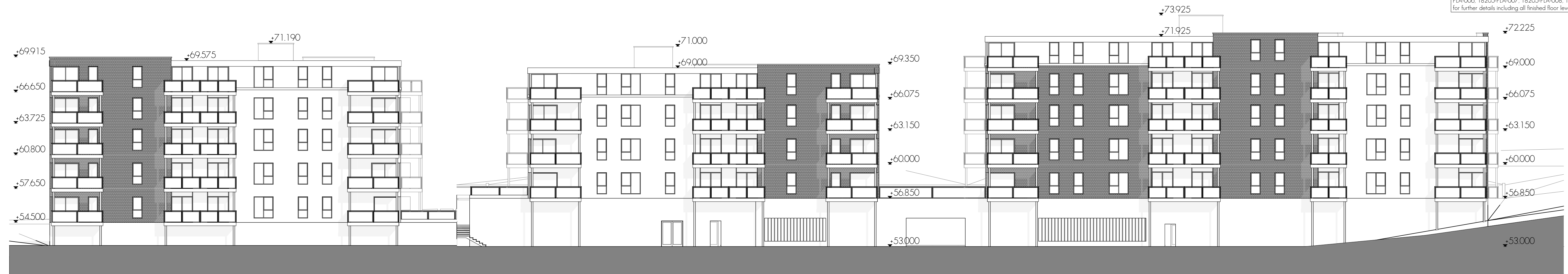
REAR ELEVATION (SOUTH) 1:200

THIS DRAWING IS FOR PLANNING PERMISSION PURPOSES ONLY. FURTHER DRAWINGS AND STUDIES WILL BE REQUIRED FOR CONSTRUCTION AND TO ENSURE COMPLIANCE WITH RELEVANT BUILDING REGULATIONS AND STANDARDS. NOTE: Refer to 1:500 site layout drawings 18205-PLA-004, 18205-PLA-005, 18205-PLA-006, 18205-PLA-007, 18205-PLA-008, 18205-PLA-009 & 18205-PLA-010 for further details including all finished floor levels (FFL) & dimensioning.