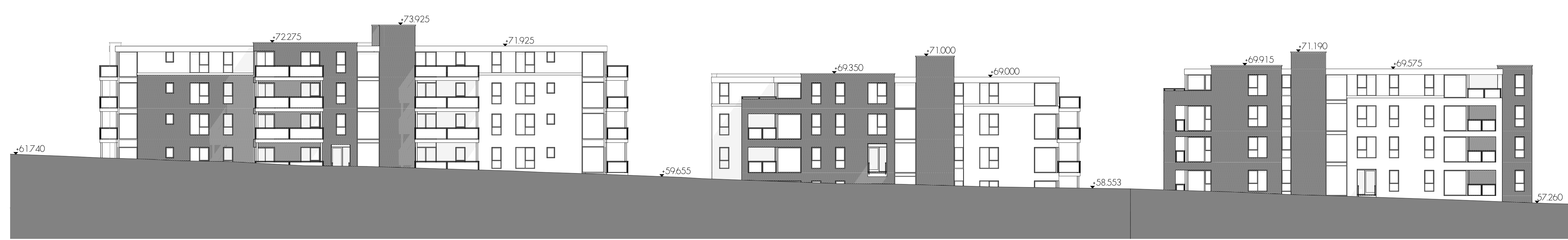
STREET ELEVATION (NORTH) 1:200