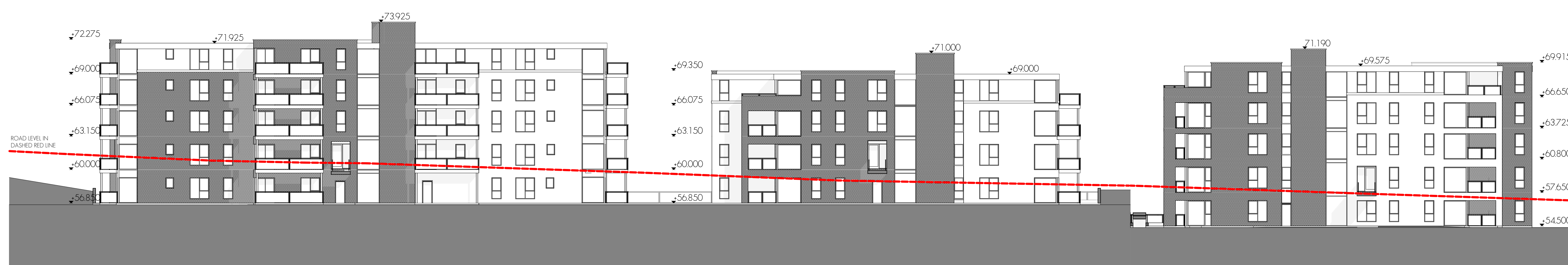
FRONT ELEVATION (NORTH) 1:200